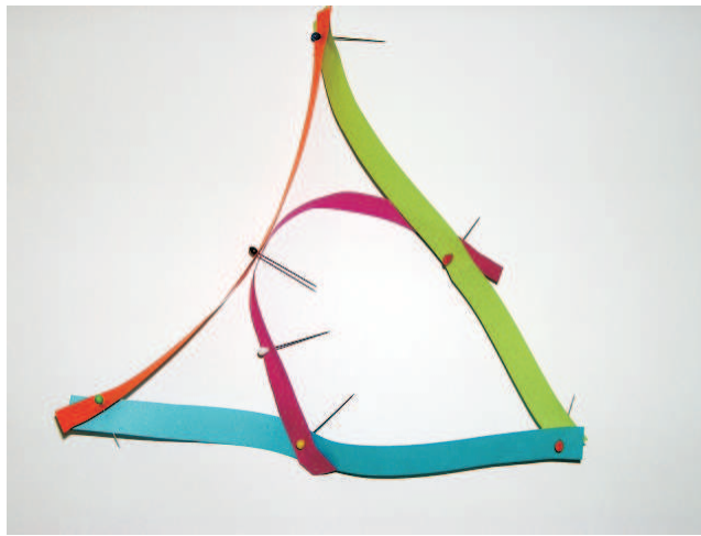
Figure 2. The pin-stripe model.

We will discuss the possibility of the reconstruction of the topological structure of the space time via the framework theory, recently developed by the author (elements of the framework theory had been discussed during the author's oral communication at the last Mathematical Workshop '05). Recall that a framework is a pair of sets (P, \pi) , where \pi \subseteq 2^P . The elements of P are called places , the family \pi contains sets of those places which are "glued" together by possible presence of some physical object (e.g. a particle in some model of the reality) or simply by possible presence of a "virtual observer". Elements of \pi are also called abstract points . Finite frameworks may be very illustratively represented by the pin-stripe model, where stripes represent the places and pins stand for the abstract points: